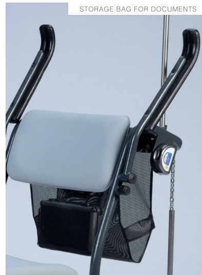
STORAGE BAG FOR DOCUMENTS