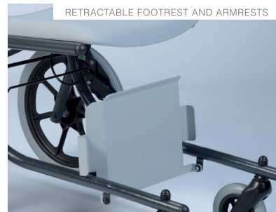
RETRACTABLE FOOTREST AND ARMRESTS